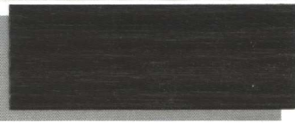
**Ebony 613 ***Ebony 706