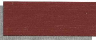
**Burgundy 650 ***Burgundy 731