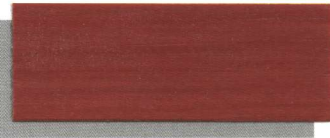
*Autum Red 541