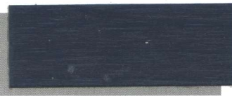
**Blue 653 ***Blue 737

Please note there may be colour deviations depending on the substrate