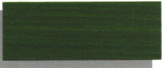
*Forest Green 526