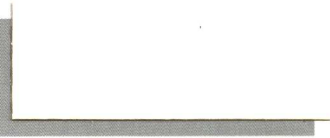
**White 535 ***White 701