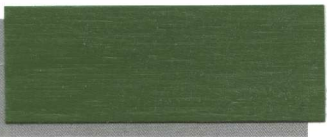
**Beech 615 ***Spring Green 709