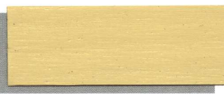
**Light Sand 610 ***Light Sand 705