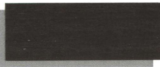
*Antique Brown 527