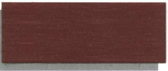
**Antique Red 607 ***Antique Red 711