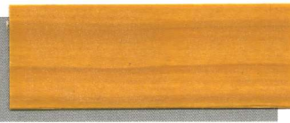
*Yellow Pine 553