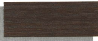
*Woodtar Brown 520