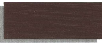
**Russet 611 ***Russet 708