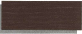
**Nut Brown 603 ***Nut Brown 732