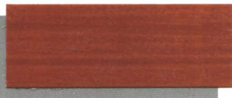
*Oregon Pine 516